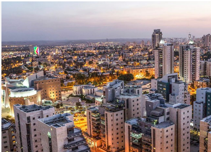
Today's Beersheba in Israel near Mamron where Abraham lived in his tents