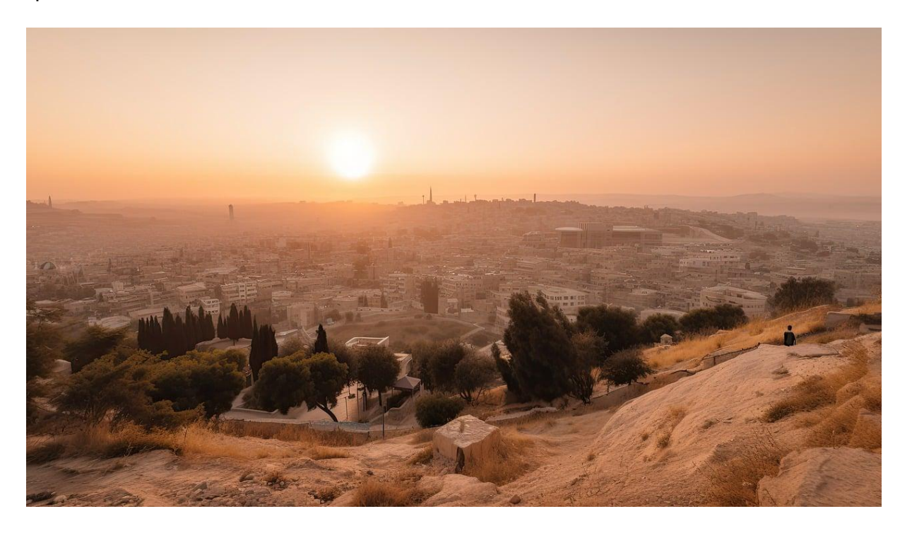
"Therefore have I also said, I will not drive them out from before you, but they shall be to you as an incentive, and their gods shall be a snare to you." (Judges 2:3)

Hamas was also once founded thanks to Israel to lame the PLO. This has obviously gotten pretty out of hand. Let's realize that this Israel is not yet the reborn Israel spoken of at the end of Ezekiel 37.