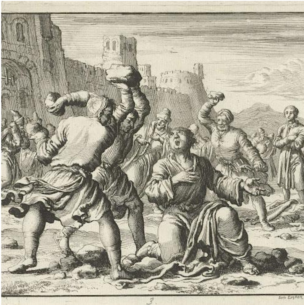
The stoning of Stephen

All enemies of light will be bound in short order, and these will lose their freedoms forever, for endless ages.