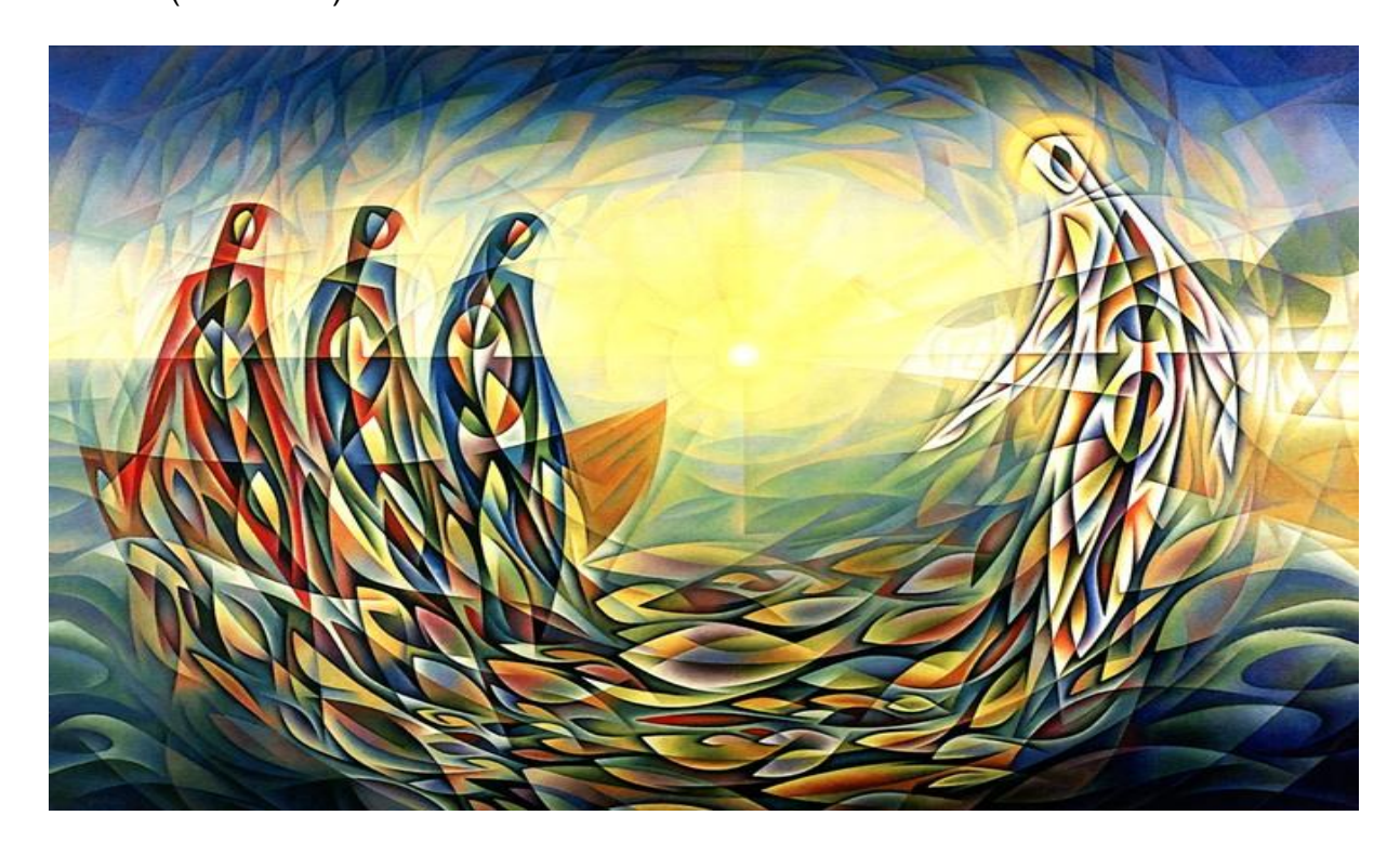
Everyone's process of making one after one into an apprentice.. fish after fish...

The Hebrew letters for 'Sons, children of God' together appear to yield the number 153. The narrator of the gospel began with this description: 'He who receives Him and believes in His name and acts accordingly has the privilege of becoming a child of God. (John 1:12).