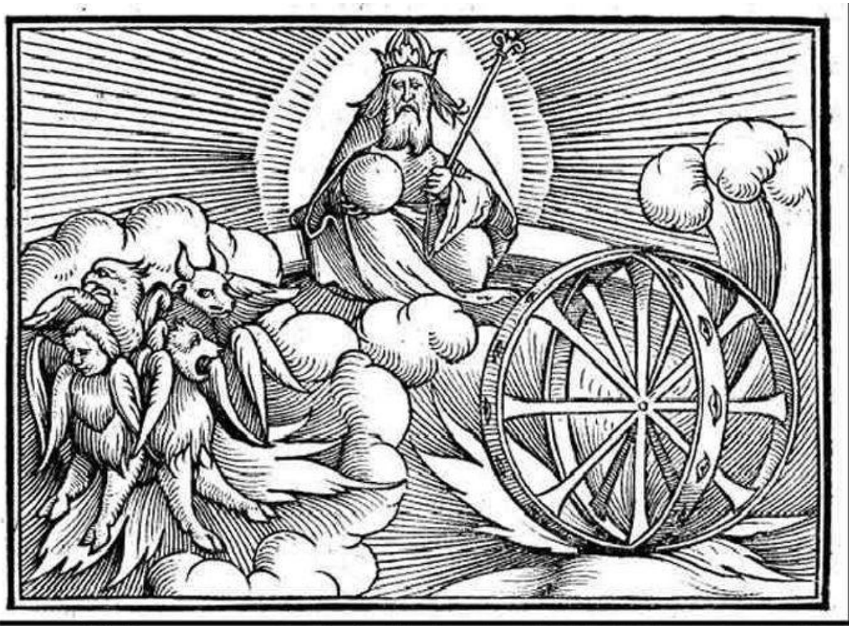
The Old Testament prophet had a vision of God's throne chariot

All principles of God include the masculine and feminine. Man's free will is also their conscience. According to Böhme, the conscience would reside in the soul or in the heart as the "inner eye". Jakob Boehme's main work is "Mysterium magnum" [1640]. Other books include the "Triple Life" and the "Three Principles". The Dutch, German and English translated book "Aurora" ["Red of the dawn in rise" - also in Dutch] is highly recommended. Most of his books are in English, the German-language almost only in Old German.