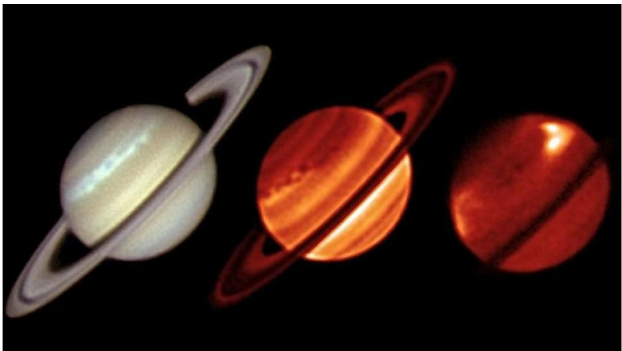
A big storm on Saturn.

“This is our famous butterfly. You have learned how this animal is captured and what it is used for; it is not really necessary to mention how the women on Saturn use it as an adornment. But in passing it can be mentioned that some women who are very vain cover their entire bodies with the wings of this butterfly, so that when you look at them they look almost like the butterfly itself This should suffice, because it is not necessary to learn more about it, and as far as I am concerned this display of vanity is no more pleasing to Me here on Saturn than it is on Earth.” [Sa.01_018,12]